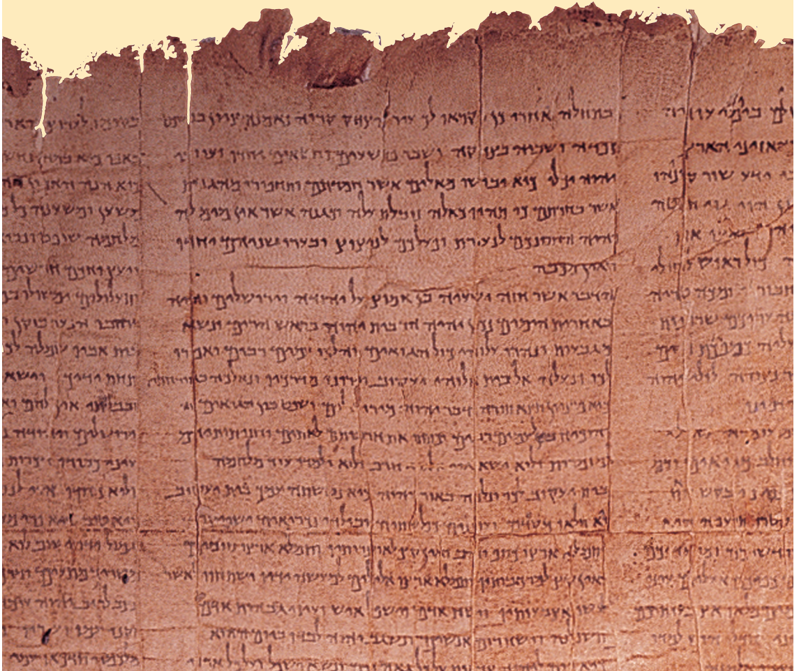
Fragment of Isaiah scroll from the Dead Sea Scrolls

which they call a world religion. But the fact remains that the tensions among Christianity, Judaism, Hinduism, Buddhism, and Islam are just as sharp today as they ever have been, even though milder methods of propagation or protection are usually employed today than in earlier ages. They still give entirely different answers to the question, "What must I do to be saved?"