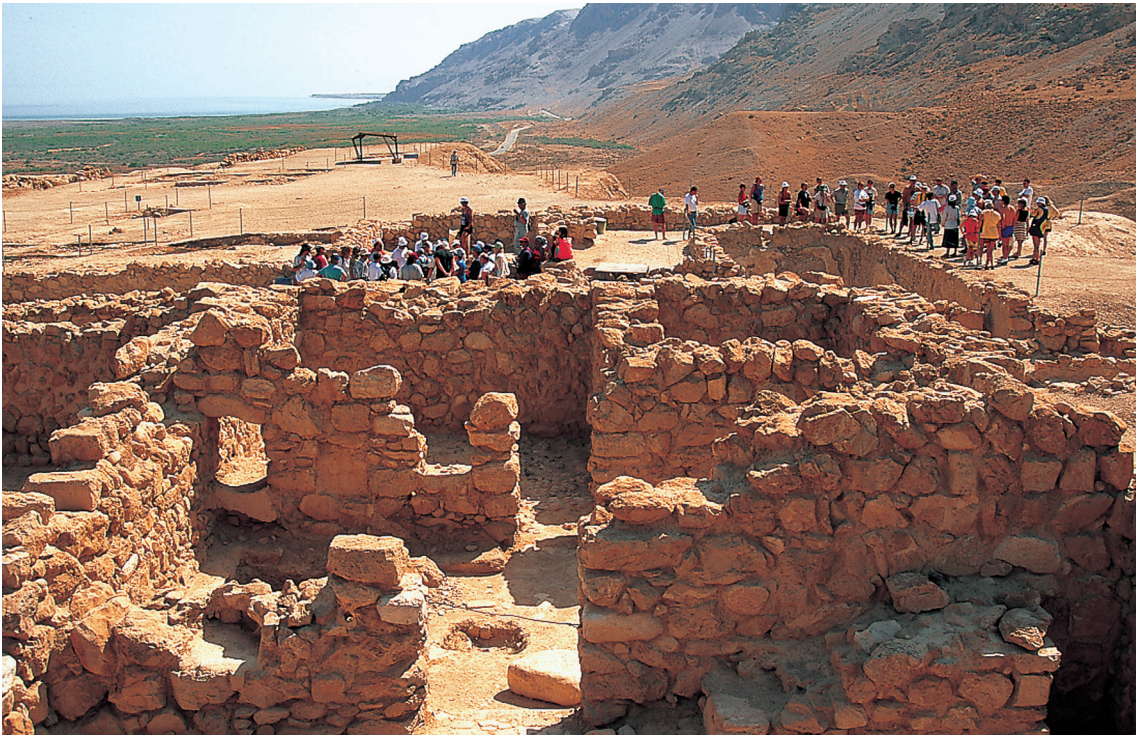
The settlement buildings at Qumran. Some of the Dead Sea Scrolls were found at Qumran.

the pages of Holy Writ and establishes a personal relationship, rather than merely instilling propositional truth into his mind. ( Propositional here refers to the kind of truth which may be stated in propositions, such as, "God is an eternal Spirit." Propositions may be grasped as mere objects of knowledge, like mathematical formulas; but divine truth, it is urged, can never be mastered by man's mind. Divine truth reaches man in an "I-Thou" encounter; it is like an electric current with both a positive pole and a negative pole as conditions for existence.) Since the biblical text was written by human authors, and all men are sinful and subject to error, therefore, it is claimed, there must be error in the biblical text itself. But, it is argued, the living God is able to speak even from this partially erroneous text and bring believers into vital relationship with Him in a saving encounter.